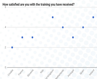
Figure 3. Satisfaction level among Euronet members with their MPH training

would be desirable to further unify MPH criteria in order to increase training quality and mobility.