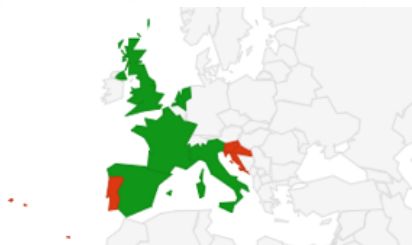
Figure 2. Euronet countries with an official certificated MPH title

The residents satisfaction with the training received during the MPH was assessed with the question “How satisfied are you with the training you have received?”. The results show a median satisfaction of 3.5 points out of 5 [IQR: 2 -5] (See figure 3). Moreover, residents were asked about what kind of changes they would like to observe inside the MPHs programmes (Table 1).