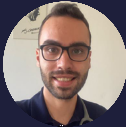
Alp Özünlü Communication